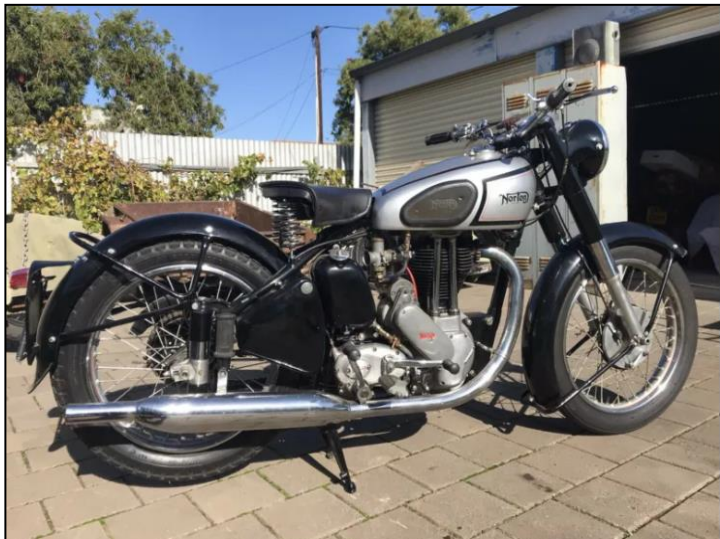
For Sale - 1950 ES2 Fully restored $14,00 Con 0417 005 235