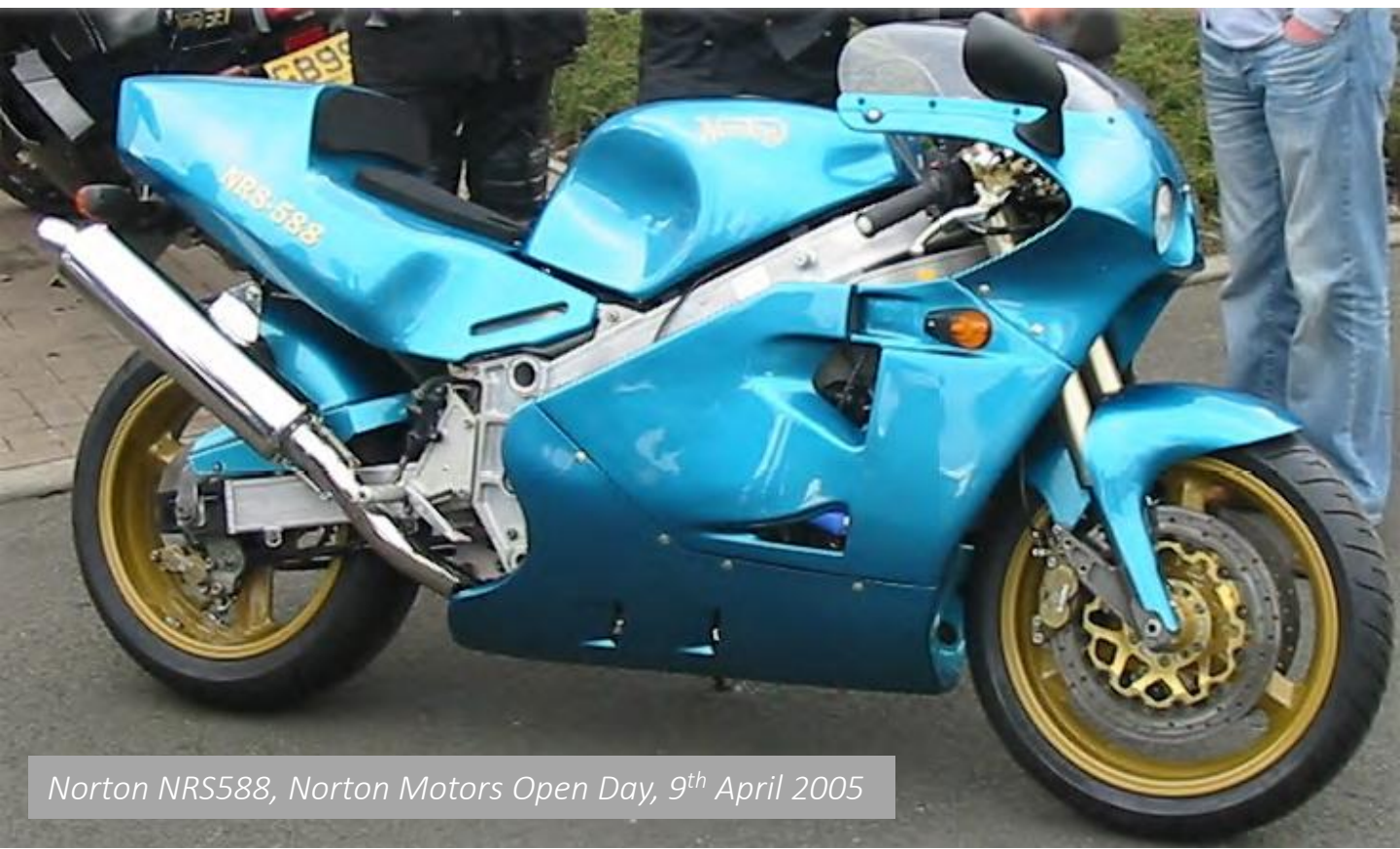
Norton NRS588, Norton Motors Open Day, 9 th April 2005